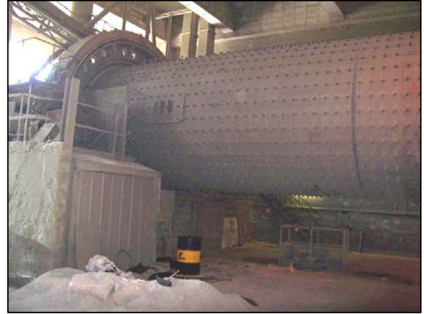
Final Mill - FCB