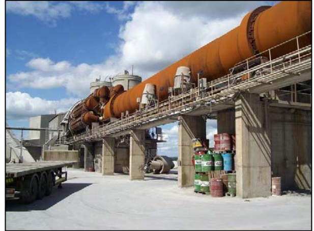
Kiln with Planetary Coolers