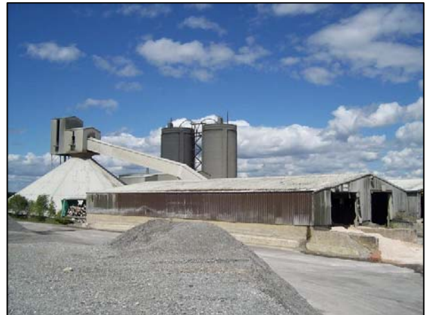
General View of Clinker Store