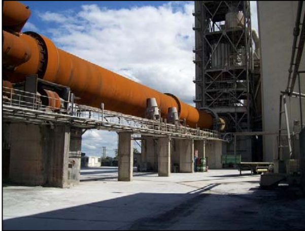
Kiln with Homogenizer Tower

The FCB Kiln is 4M dia x 87M Long and is equipped with ten planetary coolers and burner. The Kiln has been refurbished every 12 months to ensure that it is kept in optimum working condition.