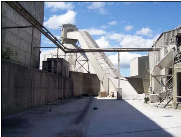
Clinker Discharge Conveyor to Clinker Store

The clinker produced from the kiln is transferred by drag slat/pan conveyors to the Clinker Store. Material is fed into the store at the central apex of the conical pyramid -shaped storage building. The building provides buffer storage for final grinding and is discharged via an underground drag slat conveyor for onward transfer to the Finish Mill.