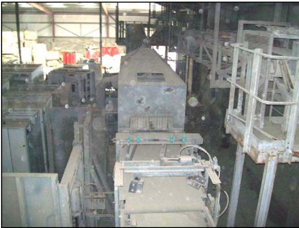
Palletizer - Infeed