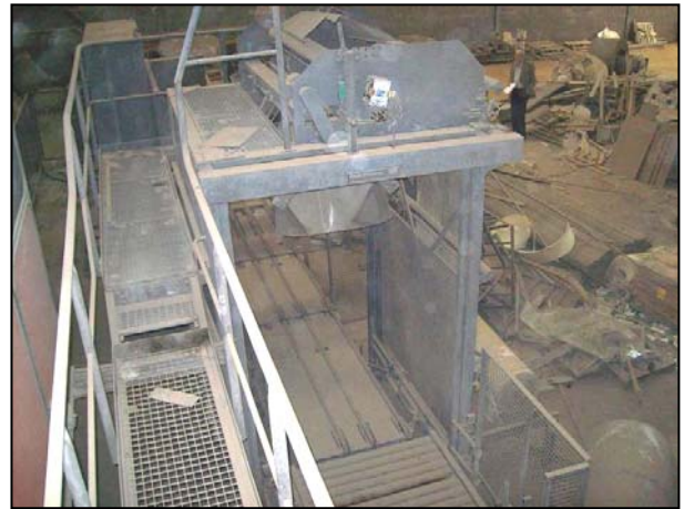
Palletizer - Discharge