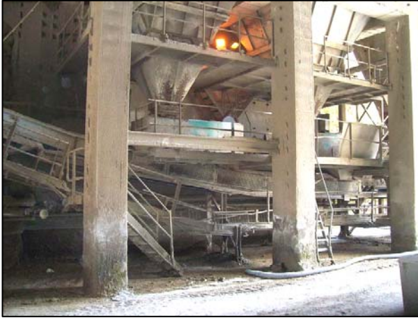
Gypsum & PFA Feed System

Prior to the Finish Mill this system provides for the introduction of gypsum, PFA and other suitable materials. It comprises of four hoppers, each with a controlled discharge feeder which feeds material to the final mix via transfer conveyors.