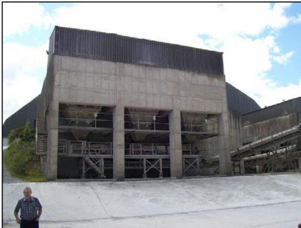
Feed System to Raw Mill

The various blended materials from (b) and (c) are fed by transfer conveyors at a controlled rate into the 4.0M dia x 12Mlong x 2000 kw FCB Ball Mill. .