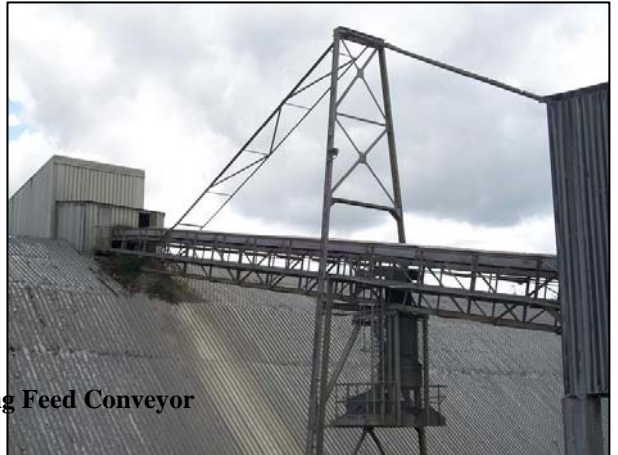
Pre-Blending Feed Conveyor